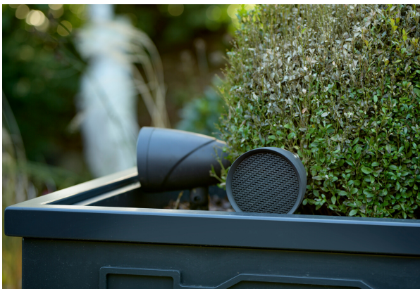
Sonance Speakers, Exterior Audio