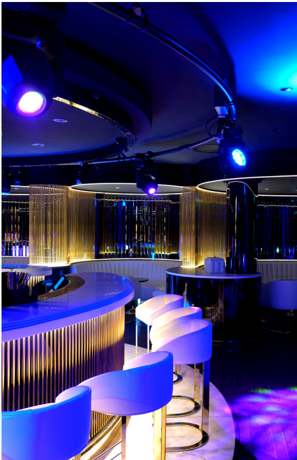
Valeria's Champagne and Cocktail Bar

In the large events spaces and Valeria's cocktail bar there are more comprehensive lighting systems, with colour changing and moving disco lights. These are a great addition for setting subtle colour effects for specific events or for making the atmosphere a little livelier during live music or a DJ set.