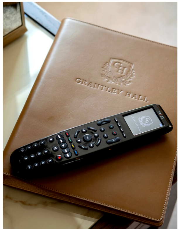
Procontrol Television Remote