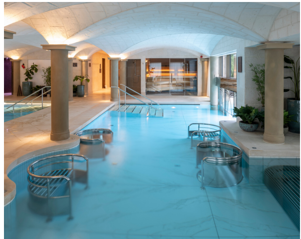
Three Graces Spa Pool