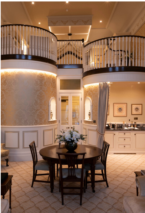
Grantley Hall, Royal Suite

To automate and control all technologies across the site, Clever Association designed a Crestron control system that allows the various entertainment, lighting and heating solutions to be automated or manually adjusted throughout the day, communicating with the sitewide BMS system. It is important that the entire venue looks and performs at its best at all times and this can be achieved with little to no input from the team. When hosting a wedding or other large event, automated lighting scenes can be overridden, setting up specific colours in the venues, to perfectly match the occasion.