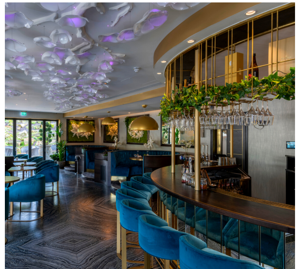
Bar and Restaurant EightyEight

Within Grantley Hall's more modern spaces, including bars, restaurants and function rooms, the audio systems really needed to pack a punch and with less restrictions from an aesthetic point of view, larger K-array systems could be used. These not only take care of the day-to-day background music demands but cater for live music events and DJ sets, with audio quality to rival some of the best nightspots in the world.