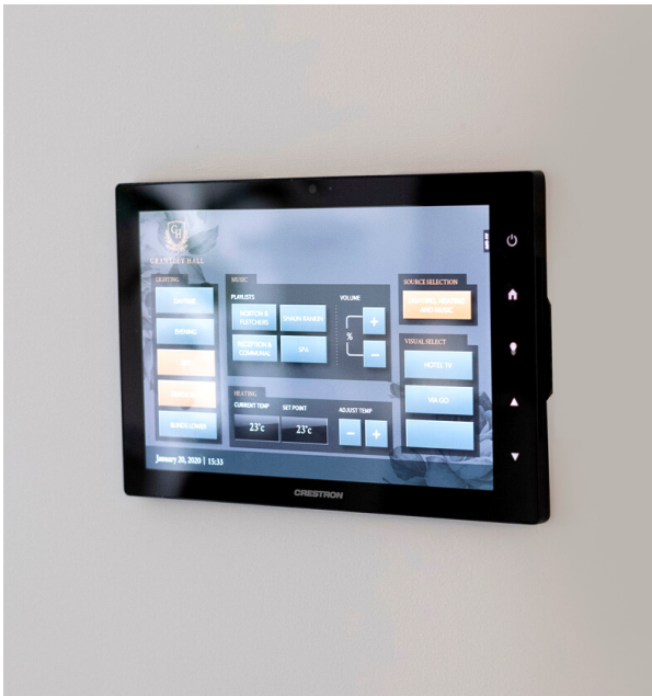
Lifestyle Office, Crestron Touch Screen