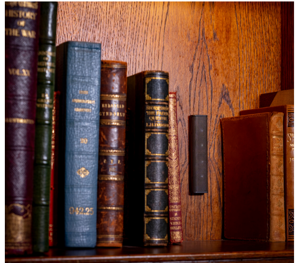
Karray Speakers, Exterior Audio

After demonstrating a variety of different loudspeaker models to the client's team, Clever Association proposed a K-array solution which was to be used for the vast majority of the communal spaces. At only ten centimetres tall and two centimetres wide, mountable to the listed timber via adhesive tape, the loudspeakers used are almost impossible to spot. Strategically placed throughout the traditionally decorated rooms, then coupled up with bass loudspeakers hidden in furniture, a rich musical tone could be created with no aesthetic impact. This solution was rolled out in the Norton Bar & Lounge, Fletcher's and Shaun Rankin restaurants too.