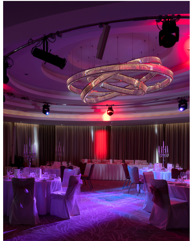
Grantley Suite, Events Space

Grantley Hall's thirty acres of stunning woodland, parkland and grounds, complete with its very own lake and English-Heritage listed Japanese garden also benefit from this level of automation. The Lutron lighting control system ensures walkways and outdoor spaces are perfectly lit on an evening, automatically coming to life as the sun sets and allowing guests to wander around the gardens and enjoy a drink as the sun sets.