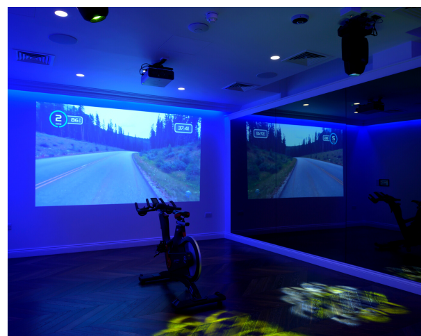
Elite Gym Spin Studio Projection