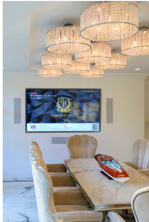
Lifestyle Office, Meeting Space

There are several meeting rooms and training spaces across the site which are used by the Grantley Hall team and their guests. These all include Kramer wireless presentation interfaces so that content can be 'cast' from smartphones, tablets and laptop computers to the in-room display. This makes it truly simple for guests to start a presentation. The on-site 'Academy' is a venue where new personnel are trained to the highest standards in hospitality, ready to take up their role at Grantley Hall. Presentation facilities are provided in this venue too, along with the ability for the system to be adaptable for many different styles of classroom or hands-on based training.