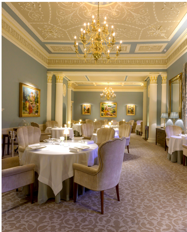
Shaun Rankin Fine Dining Restaurant