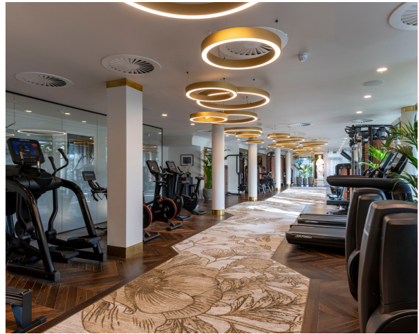
Discreet Elite Gym

Throughout the hotel and in key locations outside, input plates have been provided that allow personalised music to be played from a portable device, such as a smartphone or tablet. This versatility is great for large corporate events or weddings, where guests might require a bespoke playlist.