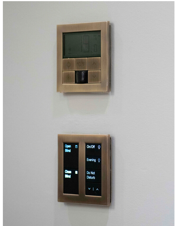
Lutron Thermostat and Lighting Keypad

Around the site, Clever Association installed a number of additional televisions and projection systems that can be used for presentations, conferences or to watch big sport events during a guests' stay.