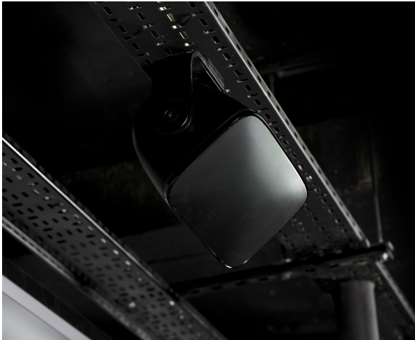
Bowers and Wilkins Loudspeaker

Working closely with architects, interior designers and on-site contractors, Clever Association worked carefully to ensure that sound is contained within the venues and ensuring that many of the larger speakers and subwoofers are out of sight, with bespoke cabinets and seating booths being used to great effect.