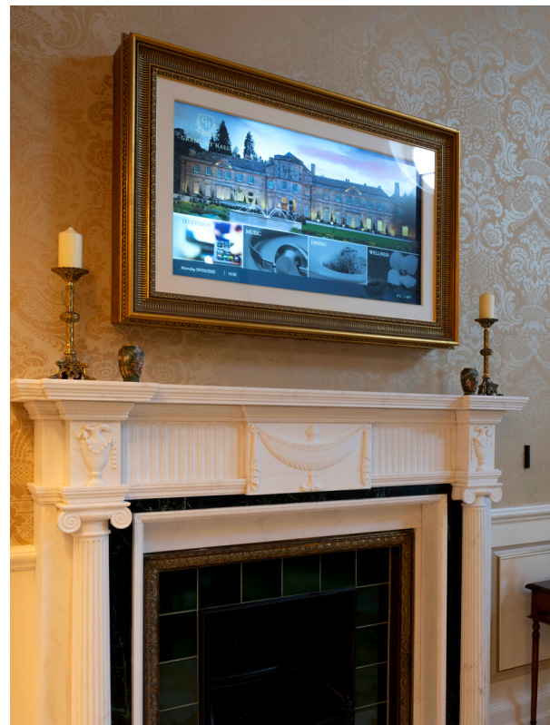
Bespoke Television and Motorised Artwork Solution

between Clever Association and the Grantley Hall team. It was important that the luxurious feel was consistent throughout the communal spaces and bedrooms too. To ensure the traditional room aesthetics weren't compromised by televisions and speakers, Clever Association designed a bespoke solution. A television and Creston soundbar were hidden behind a motorised 'rolling' piece of artwork on a Lutron mechanism, sealed within a gilt picture frame. At the touch of a button, on a Grantley Hall branded ProControl remote control, the artwork lifts. Guests can then watch Sky television via a Sky Bright Box commercial distribution system, choose from an array of radio stations, listen to Grantley Hall music playlists or 'cast' their own music to the system. Bowers & Wilkins loudspeakers were hidden within vanity units in the ensuite bathrooms, so that the chosen music could be enjoyed in there too.